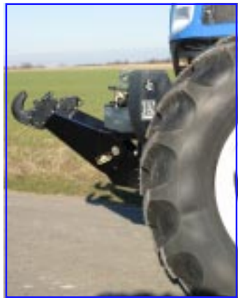
Compact: Minimal overhang from the front face.