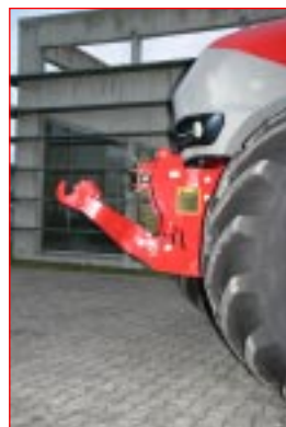
Compact: Minimal overhang from the front face