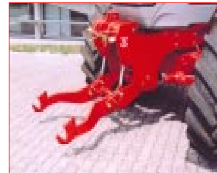
MDI 4 with suspended front axle. The maneuverability is fully retained.