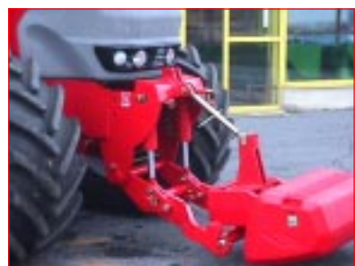
The McCORMICK weights are nicely integrated with the hitch.