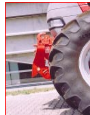
MDI 4 Folded. Minimal overhang from the front face.