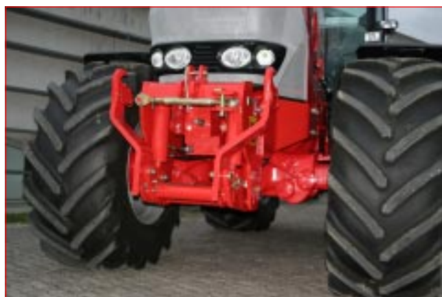
The parallel folding principle ensures functionality of float mode.