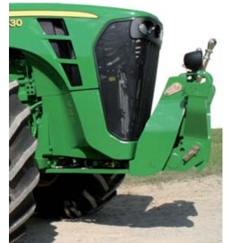
GL ST 5.3 front hitch

The foldability of the GreenLink® ST 5.3 arms makes it very compact when not used. This design also allows for great ground clearance.