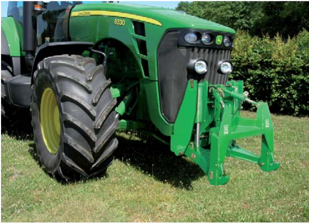
GL 80.3i front hitch (with INTERCOUPLER)

A unique expertise in front hitch integration, plus an exclusive partnership development with JOHN DEERE, has allowed LAFORGE to design an efficient line of GreenLink® front 3-point hitches to get the best output from the front end of JOHN DEERE 8030 and 8R Series tractors.