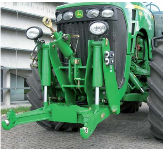
GL 80.3 front hitch with DYNA CONTOUR option

The GreenLink® 80.3i is equipped with the InterCoupler - a LAFORGE exclusive - which allows side to side ground contour following of wide implements while carrying the implement weight and controlling its working depth.